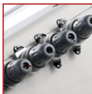
Direct drive needle bar, higher performance in sewing heavy duty