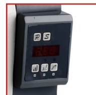
High quality control system